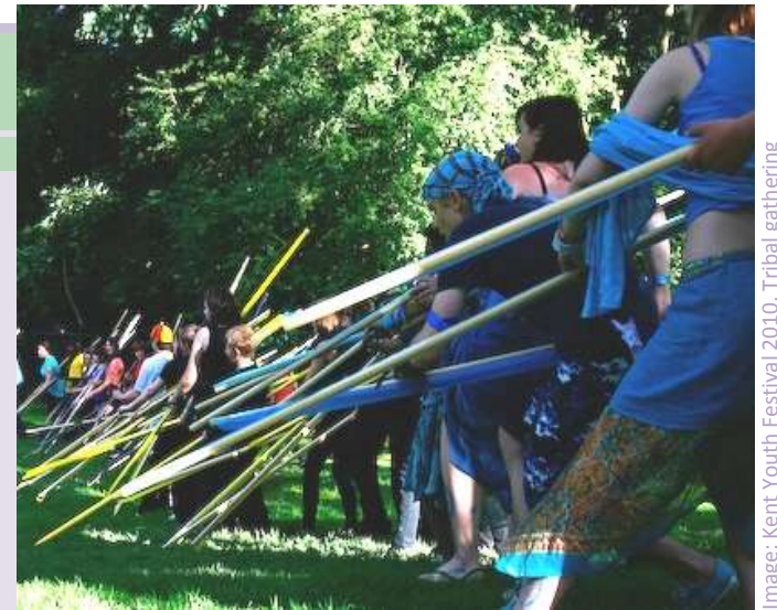
Image: Kent Youth Festival 2010, Tribal gathering