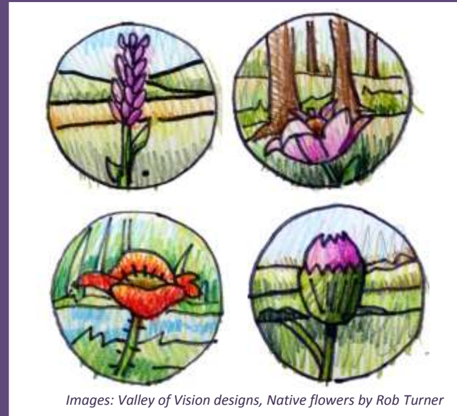
Images: Valley of Vision designs

As part of People United's GIANT PICNIC on Sunday 29 th August, Animate ran a fabulous flower making workshop. Artists invited picnic-ers to make something beautiful that lasts forever come rain or shine. The flowers, which were made from bright coloured foam, wire and a flourish of creativity, looked fantastic. The Art of Giving Flowers workshop encouraged participants to give their flower to a special someone to support the kindness ethos driven by People United's current project 'We All Do Good Things' in Herne Bay. Thankfully the weather was kind to us, and managed to hold off until the picnic had finished, so no soggy sandwiches in sight!