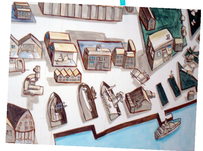
(Top) participants start creating artwork (Right) section of finished artwork

Following the success of this project, Animate is planning further projects with Little Hands and parents from Canterbury. If you would like to know more or be involved in these future plans, please contact email@animatecommunityarts.com